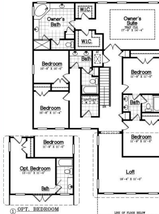
SECOND FLOOR PLAN OPTION #1